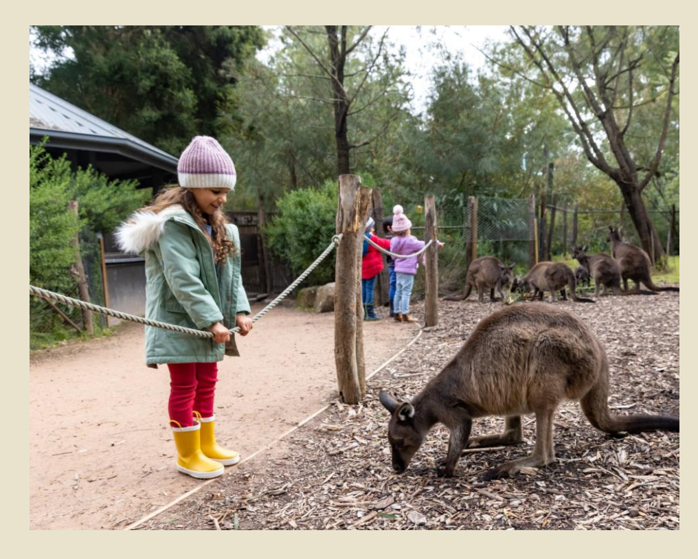
There are some parts of the Sanctuary, like in Kangaroo Country, where the animals might come near me. The animals are friendly and I will be safe. I will need to make sure to stay on the path.

I will make sure to close any gates behind me. This makes sure that the animals stay in their home. I might not see all the animals that I want to see at the Sanctuary. That's okay.