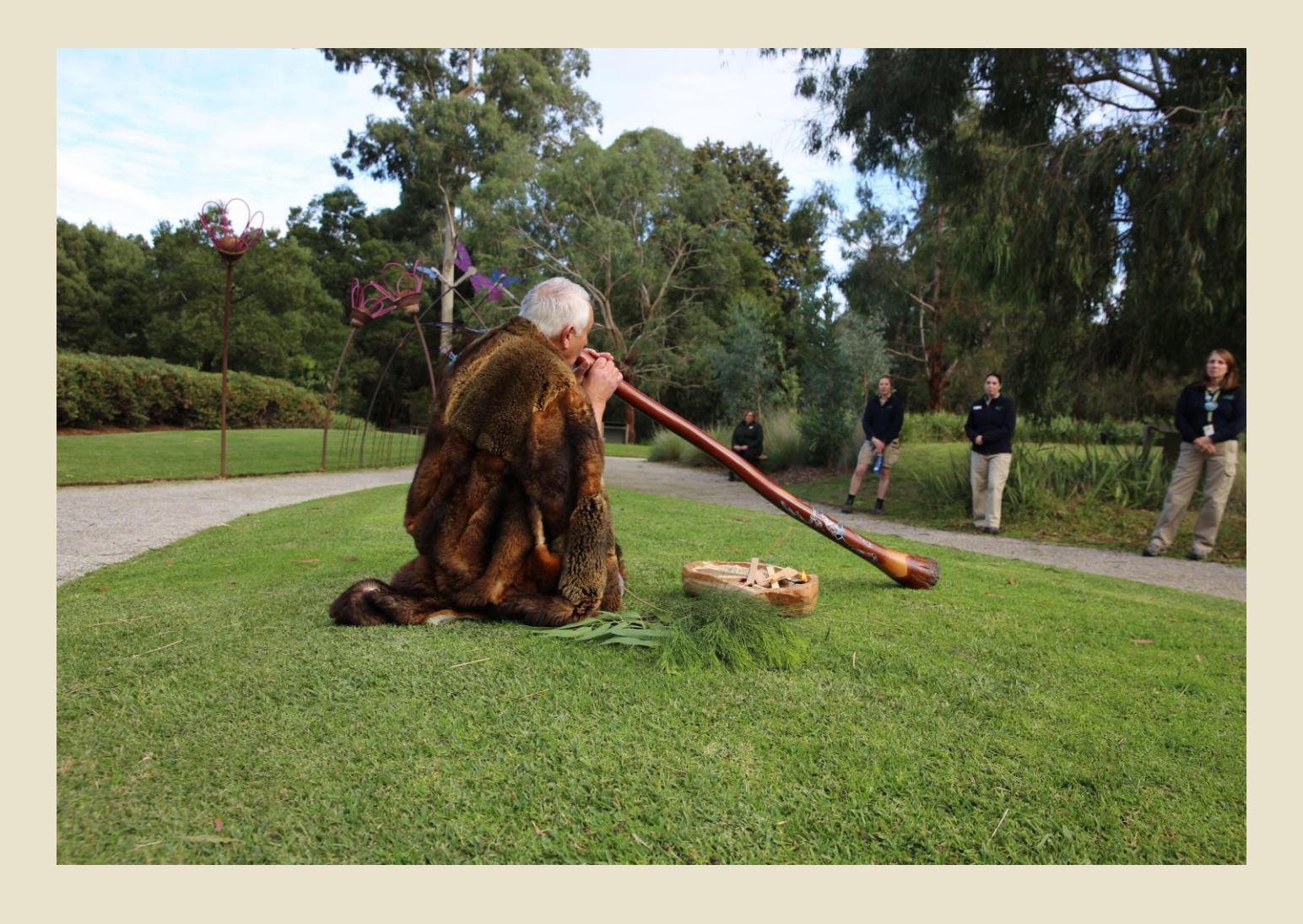
Sometimes there are events on at Healesville Sanctuary. These will be on the Zoos Victoria website.