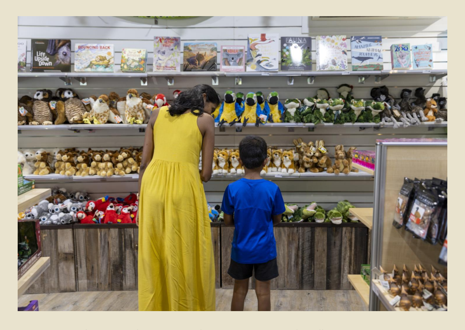
There is a shop next to the entrance to Healesville Sanctuary. Before I leave, I can look in the shop if I want to.