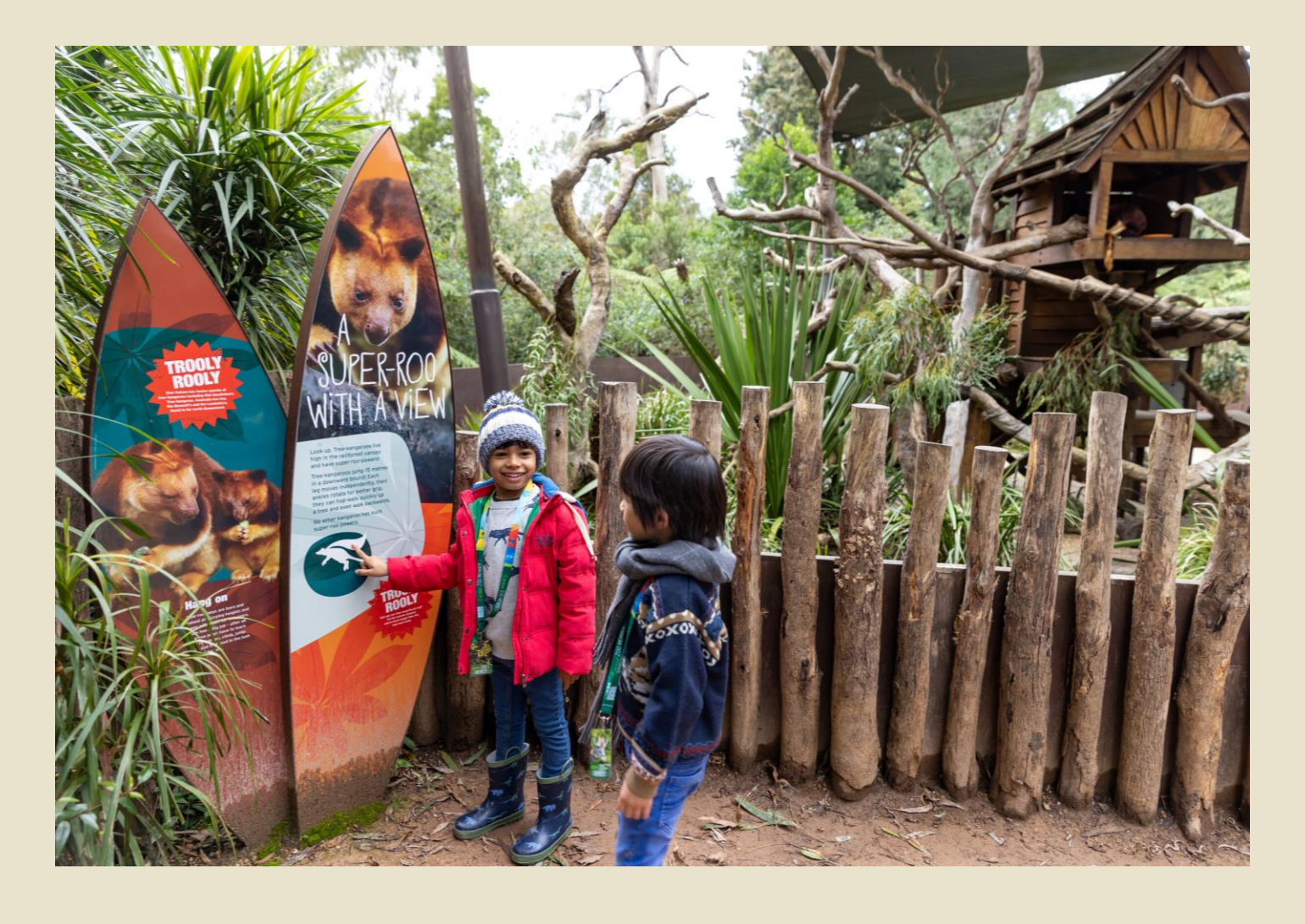
There will be signs at each of the enclosures. I can read these to learn more about the animals.