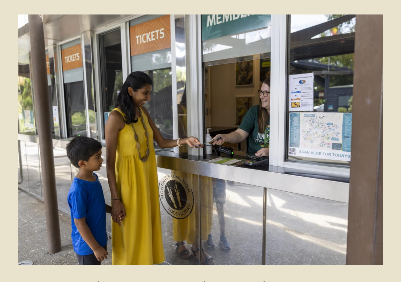
If I want a map, I can ask for one at the front desk.