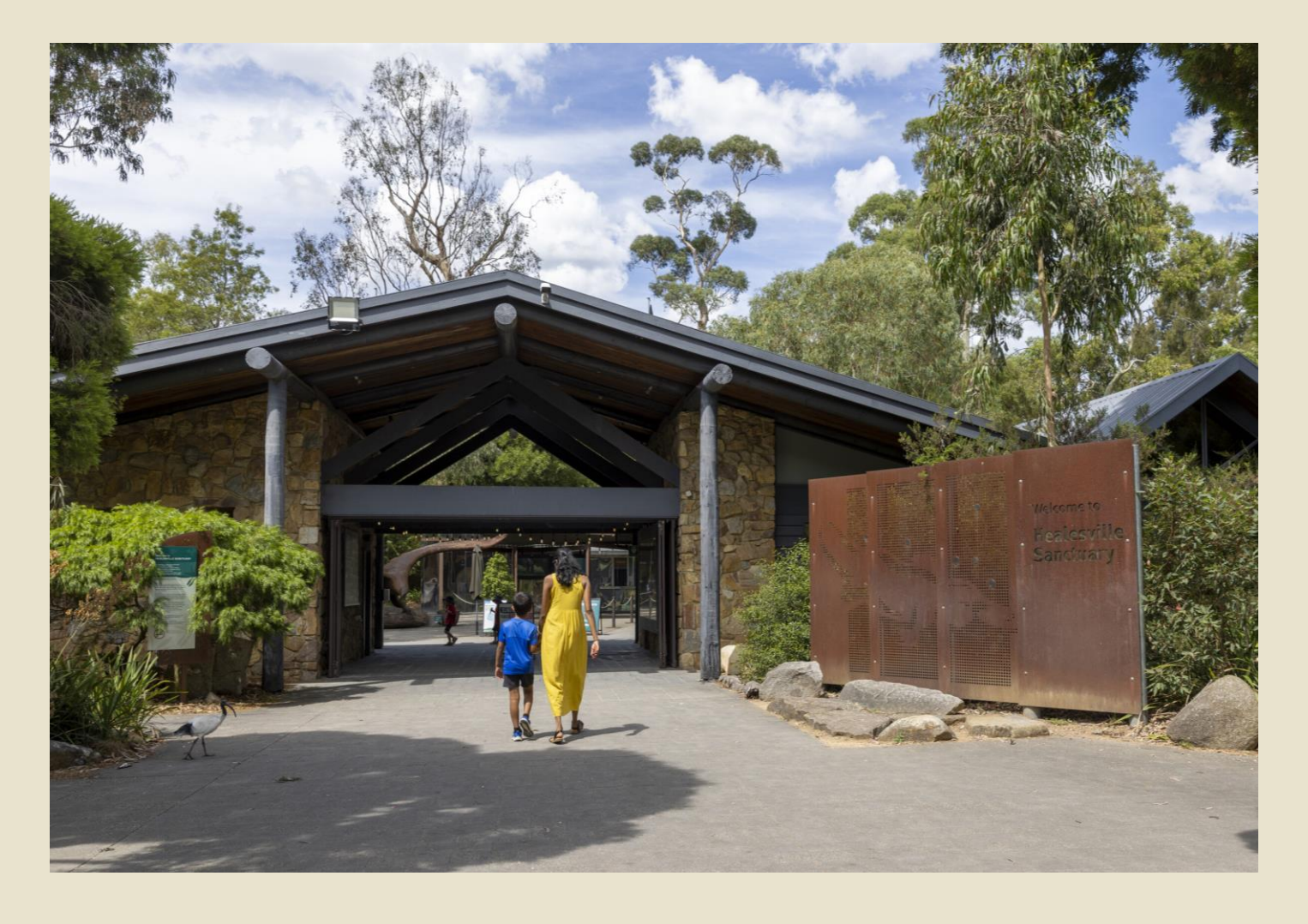
I am going to Healesville Sanctuary. Healesville Sanctuary is a zoo that has lots of Australian animals. The Sanctuary is part of Zoos Victoria.